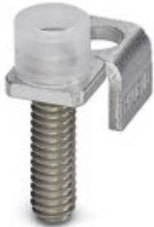
Chain bridge, pitch: 15 mm, number of positions: 1, color: silver

Please be informed that the data shown in this PDF Document is generated from our Online Catalog. Please find the complete data in the user's documentation. Our General Terms of Use for Downloads are valid ( http://phoenixcontact.com/download )